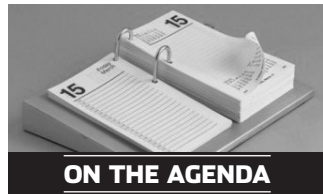
ON THE AGENDA