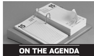
ON THE AGENDA